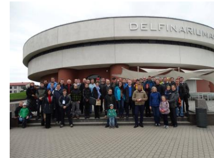
TRANSPORT MEANS 2017