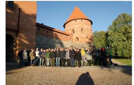
TRANSPORT MEANS 2018