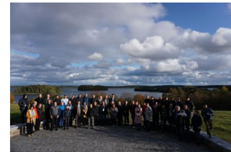
TRANSPORT MEANS 2019